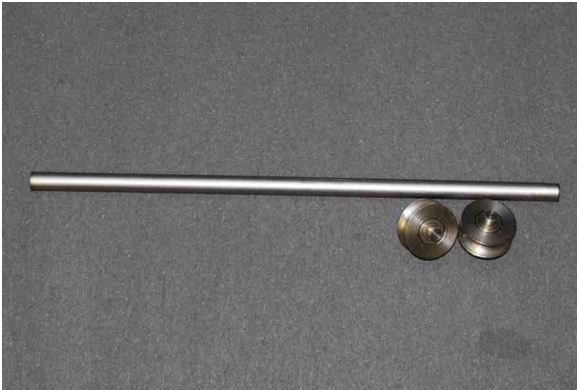
Tandem Stainless Steel 3/4" Rollers and Stainless Steel Roller Cap Track