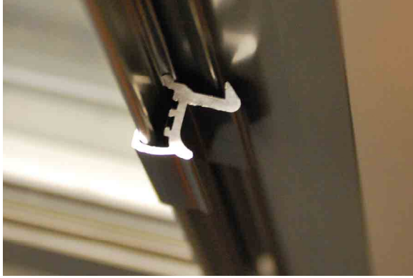
Automatic Spring-loaded Jamb Lock