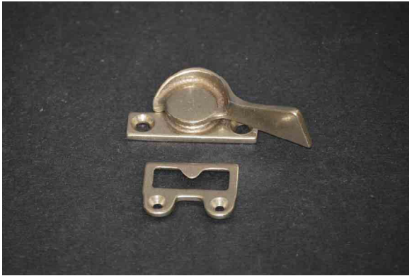
Cam Action Sweep Latches with Strike