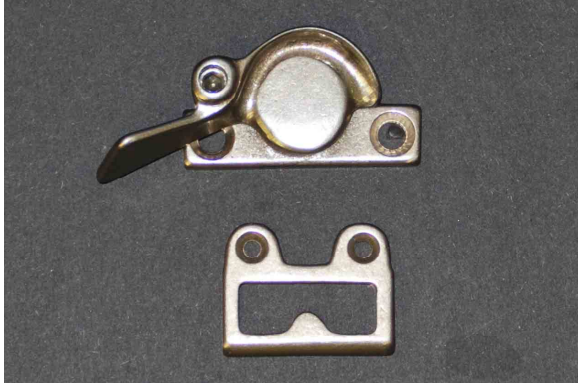
Custodial-Operated Sweep Latches with Strike