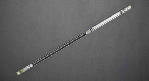
Block and Tackle Balance